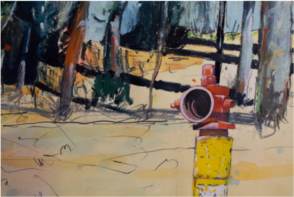
On our way to the promised land detail.