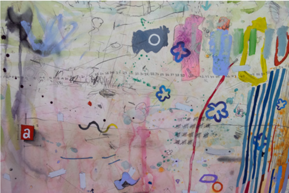
Water and life intertwined detail.