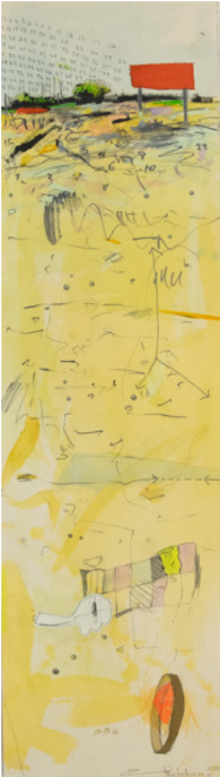
As a set.