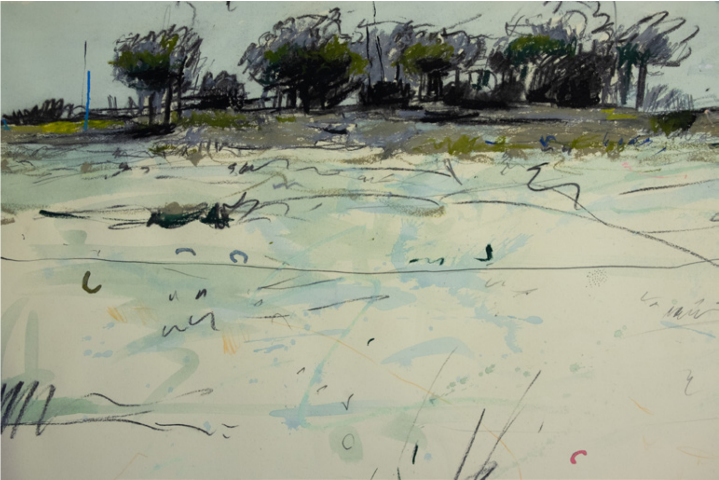
Between tree trunks detail.