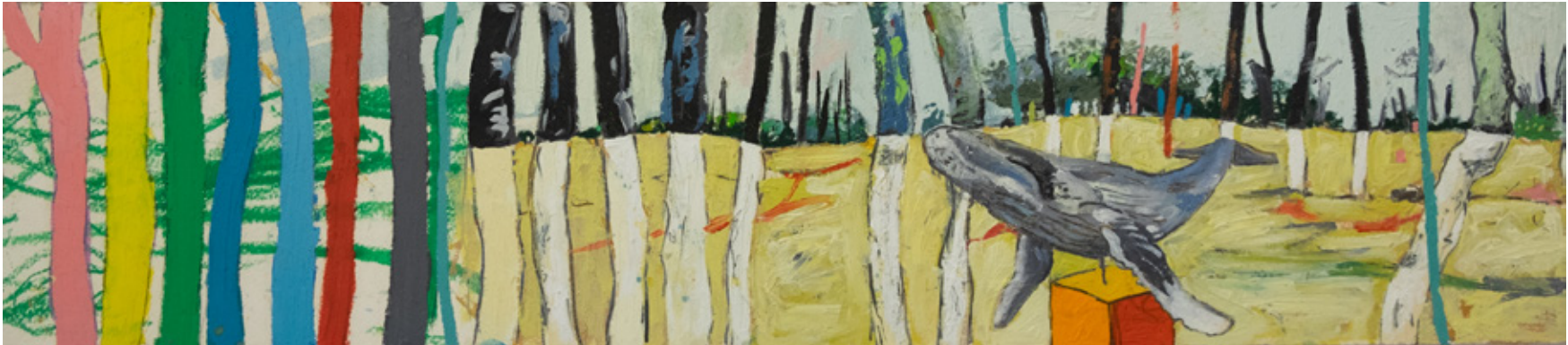
Through the woods detail.