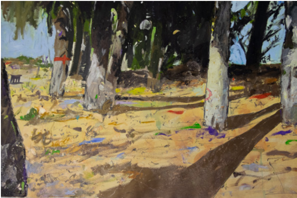
Between tree trunks detail.