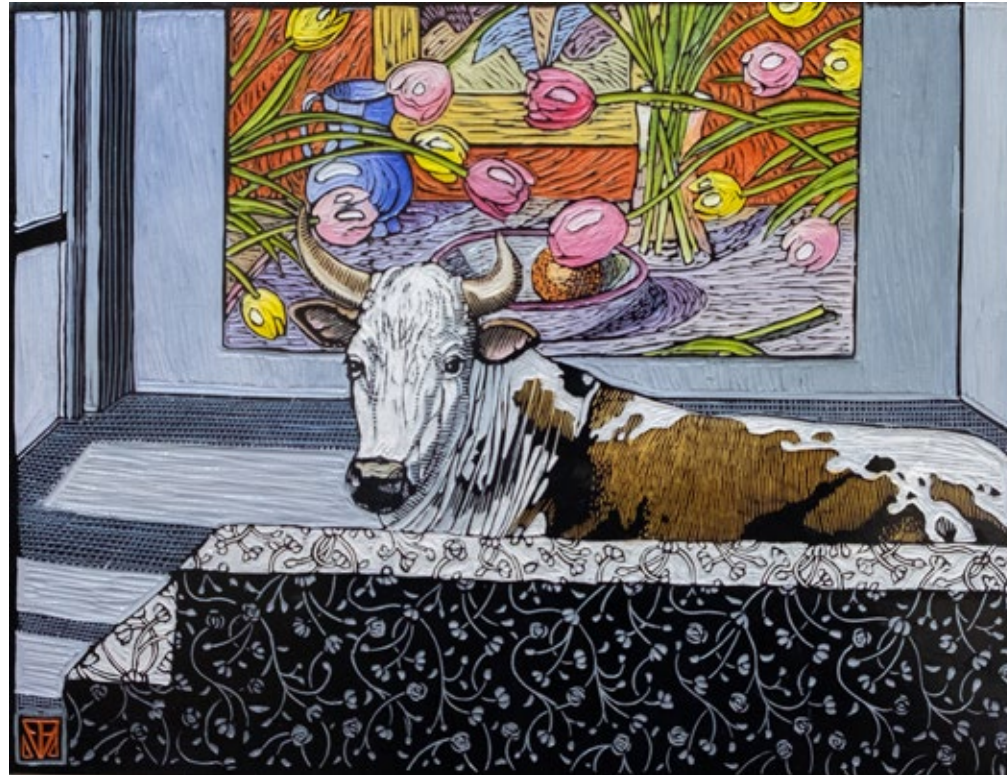
Armchair Critic (Lino) 2022 Original lino painted in oil paint 54cm x 49cm (framed)