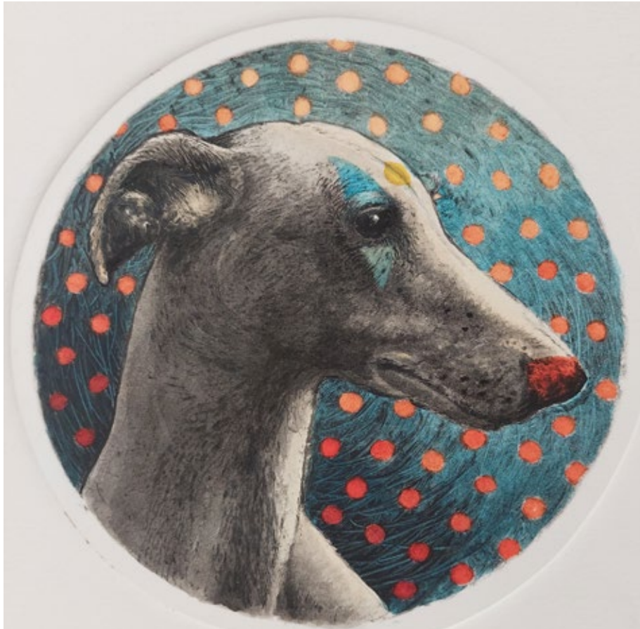
Whippet 2021 Monoprint rendered in acrylic ink 43cm x 43cm (framed)