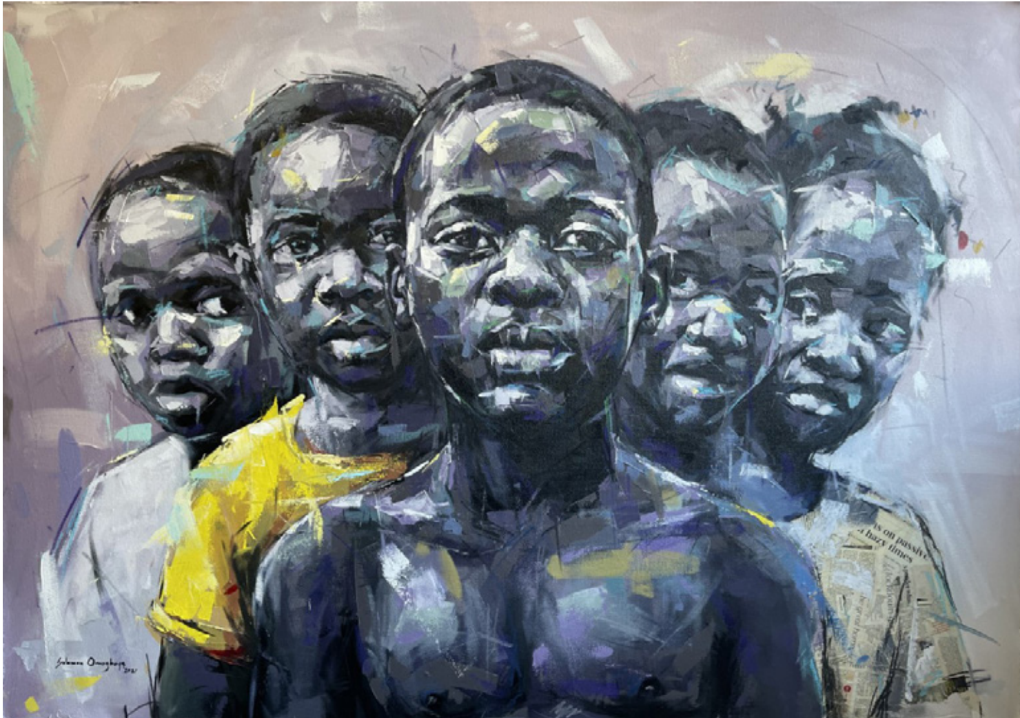
Be ready 2021 Oil, pastel and newsprint on canvas 152.5cm x 205.5cm (framed)