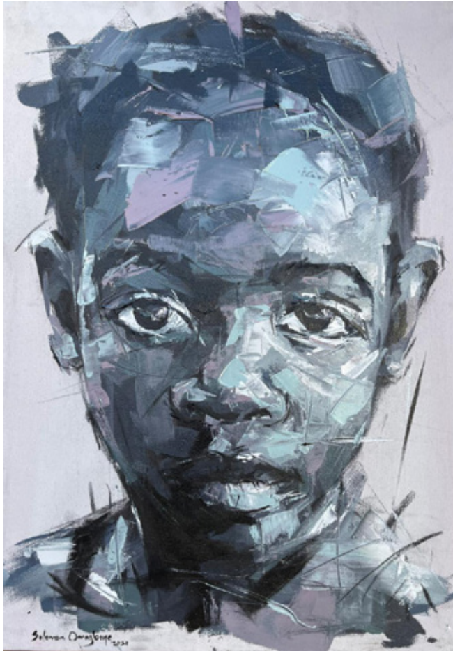
Reflect II 2021 Oil on canvas 70cm x 50cm (stretched)