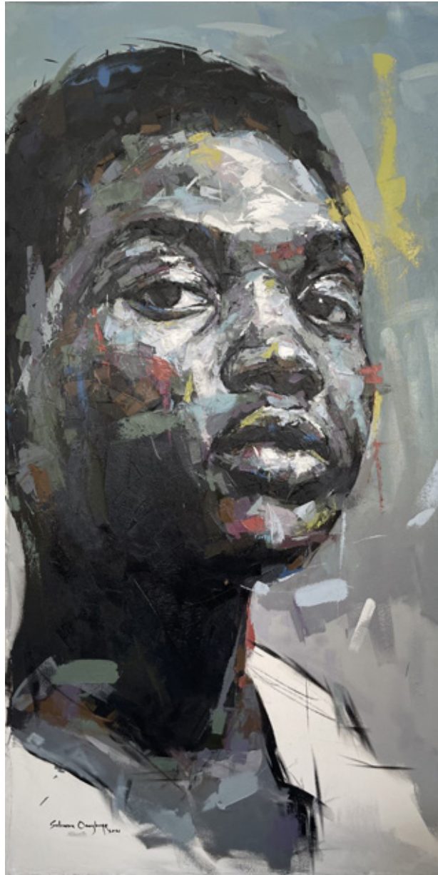
Resilience 2021 Oil on canvas 190cm x 95cm (unframed)