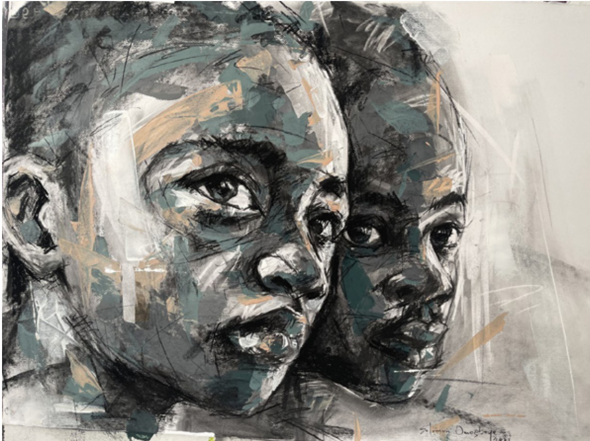
Glimmer of hope