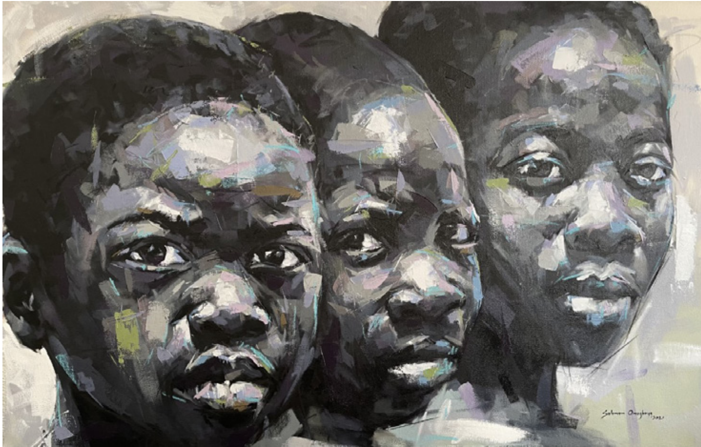
Waiting on a rainbow 2021 Oil on canvas 110cm x 170cm (unframed)