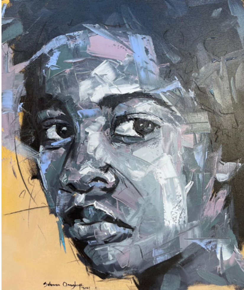
Reflect III 2021 Oil on canvas 70cm x 60cm (stretched)