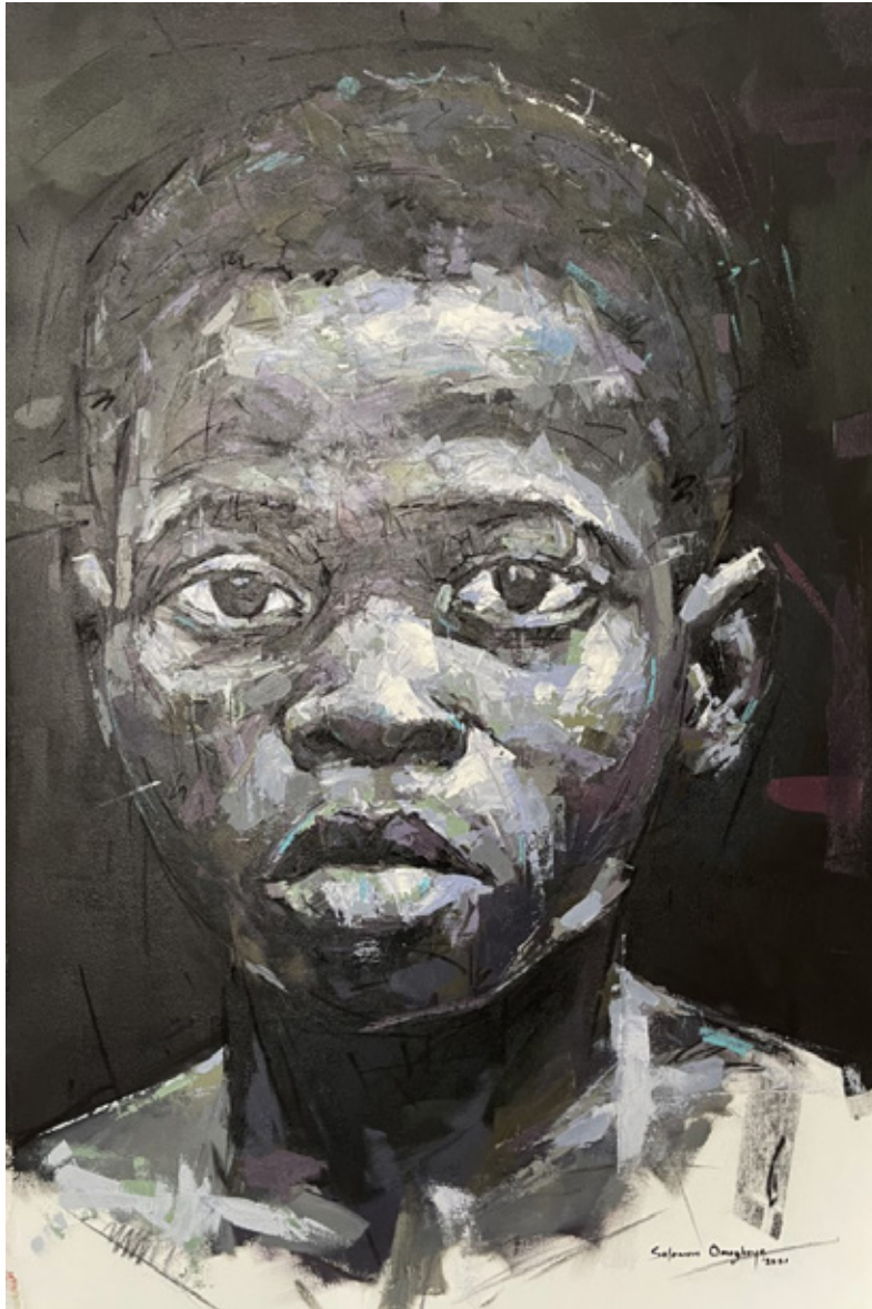
Fabric of hope 2021 Oil on canvas 165.5cm x 116cm (framed)