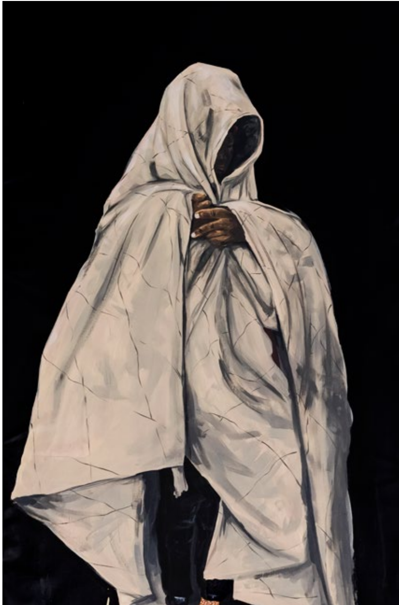
Gambling on memory's lane