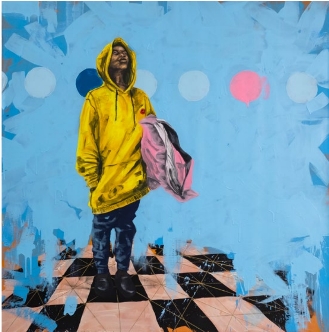
I dream, I smile I 2022 Acrylic on canvas 143cm x 143cm