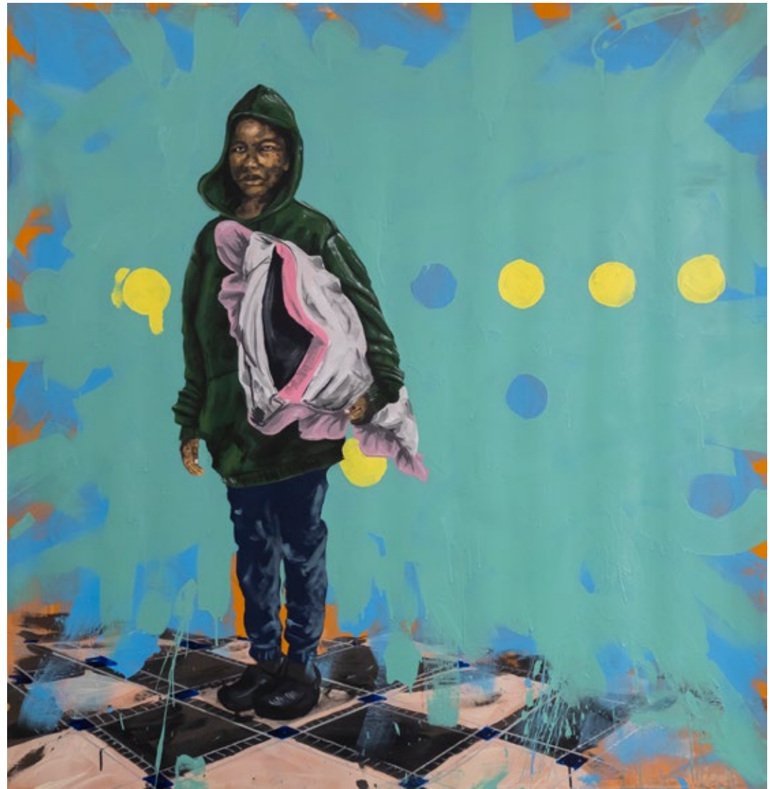
I dream, I smile II 2022 Acrylic on canvas 143cm x 143cm