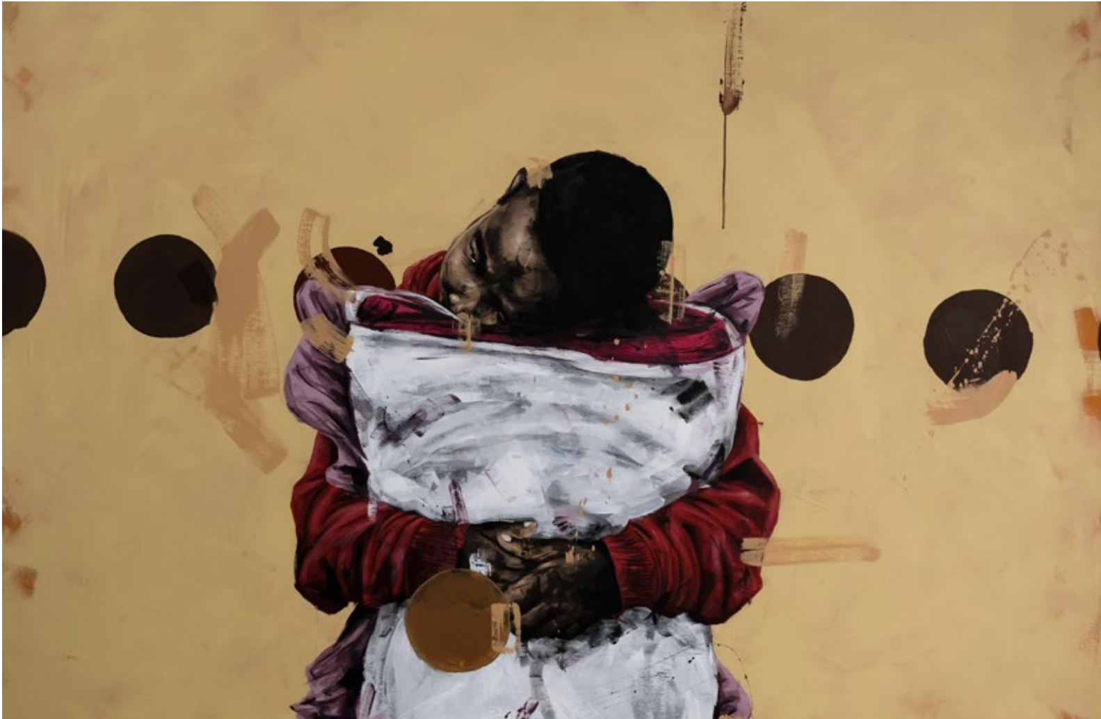
All will be gone 2022 Acrylic on canvas 187cm x 143cm