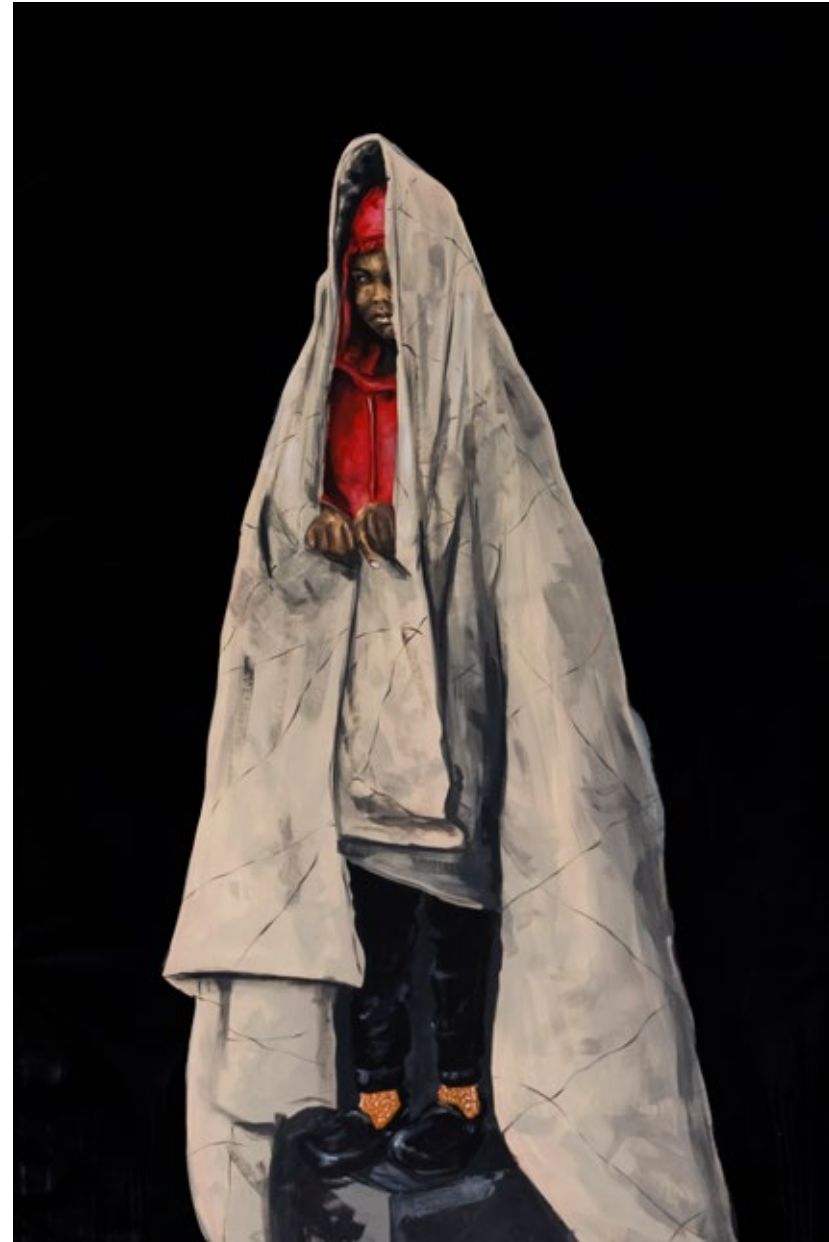
I know that we shall meet again 2022 Acrylic on canvas 195cm x 97cm