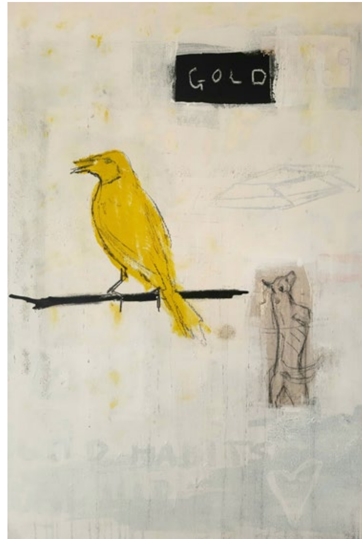
Icons 2022 Mixed media on stretched canvas 91cm x 60.5cm