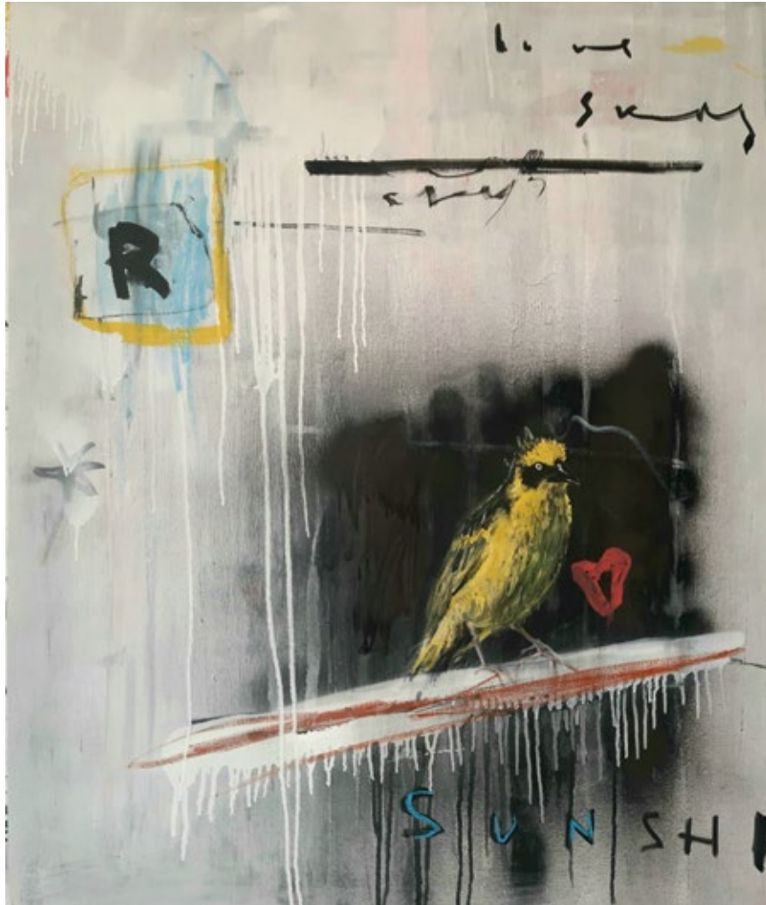
Blue Skies and Sunshine