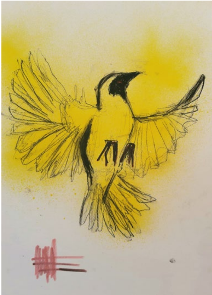
The Great Builder 2022 Mixed media on paper 42cm x 29.6cm (unframed)