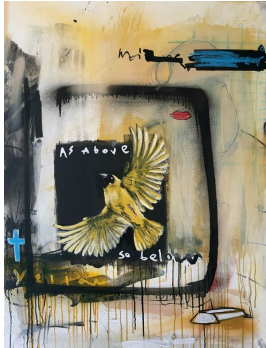
Gold, Greed and Glory 2022 Mixed media on stretched canvas 102.5cm x 75.5cm