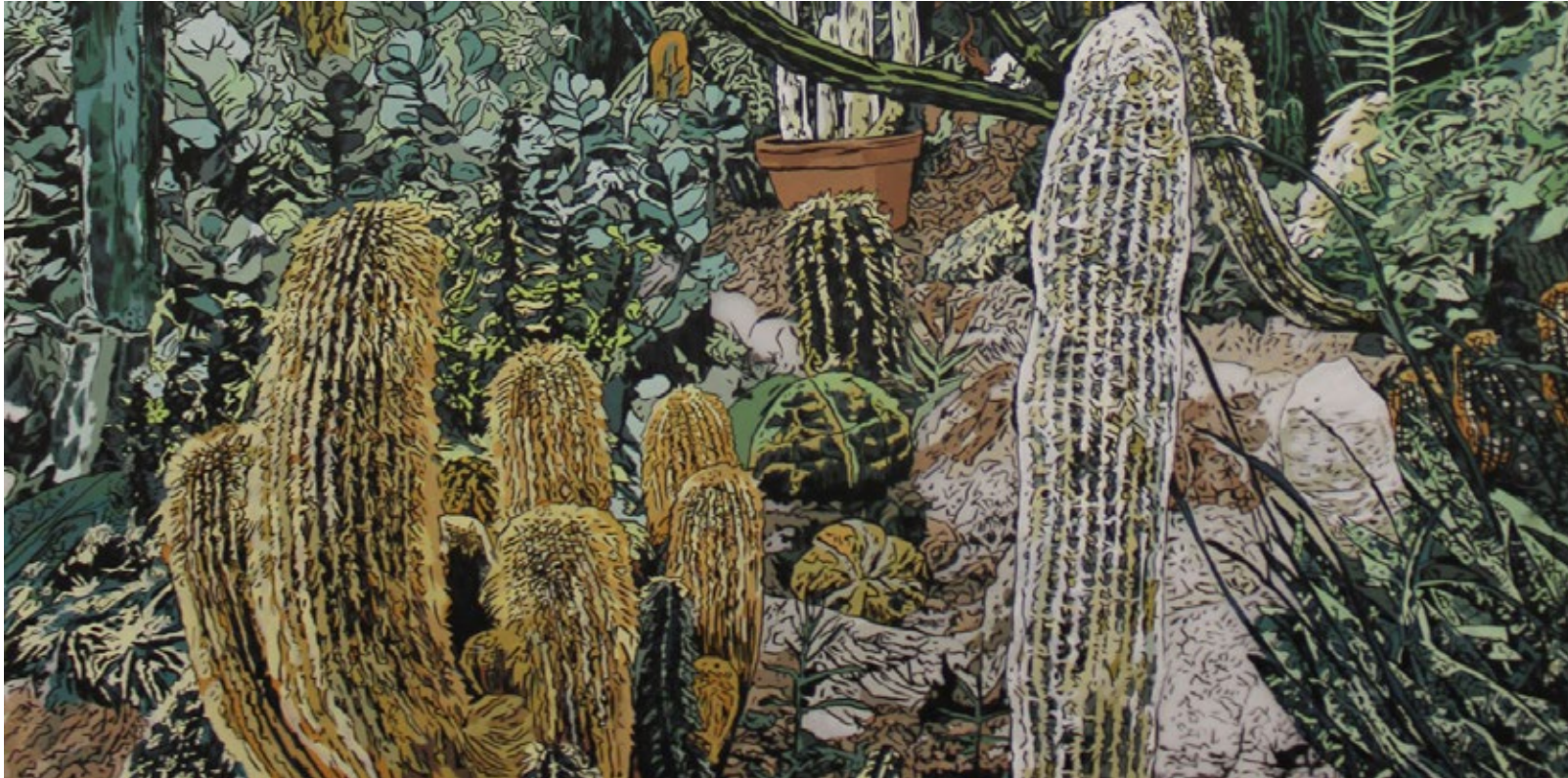
Detail of The Secret Lives Of Plants II