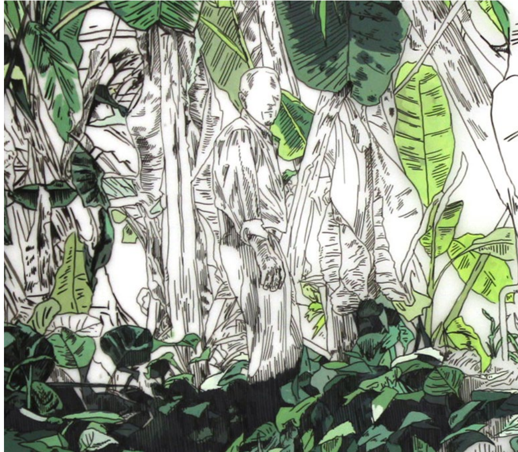
Detail of Secret Garden