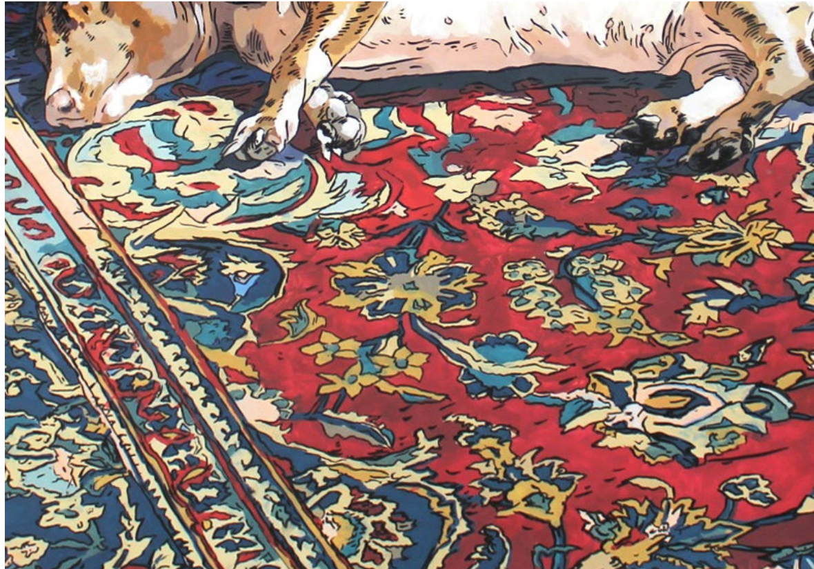
Detail of Minu