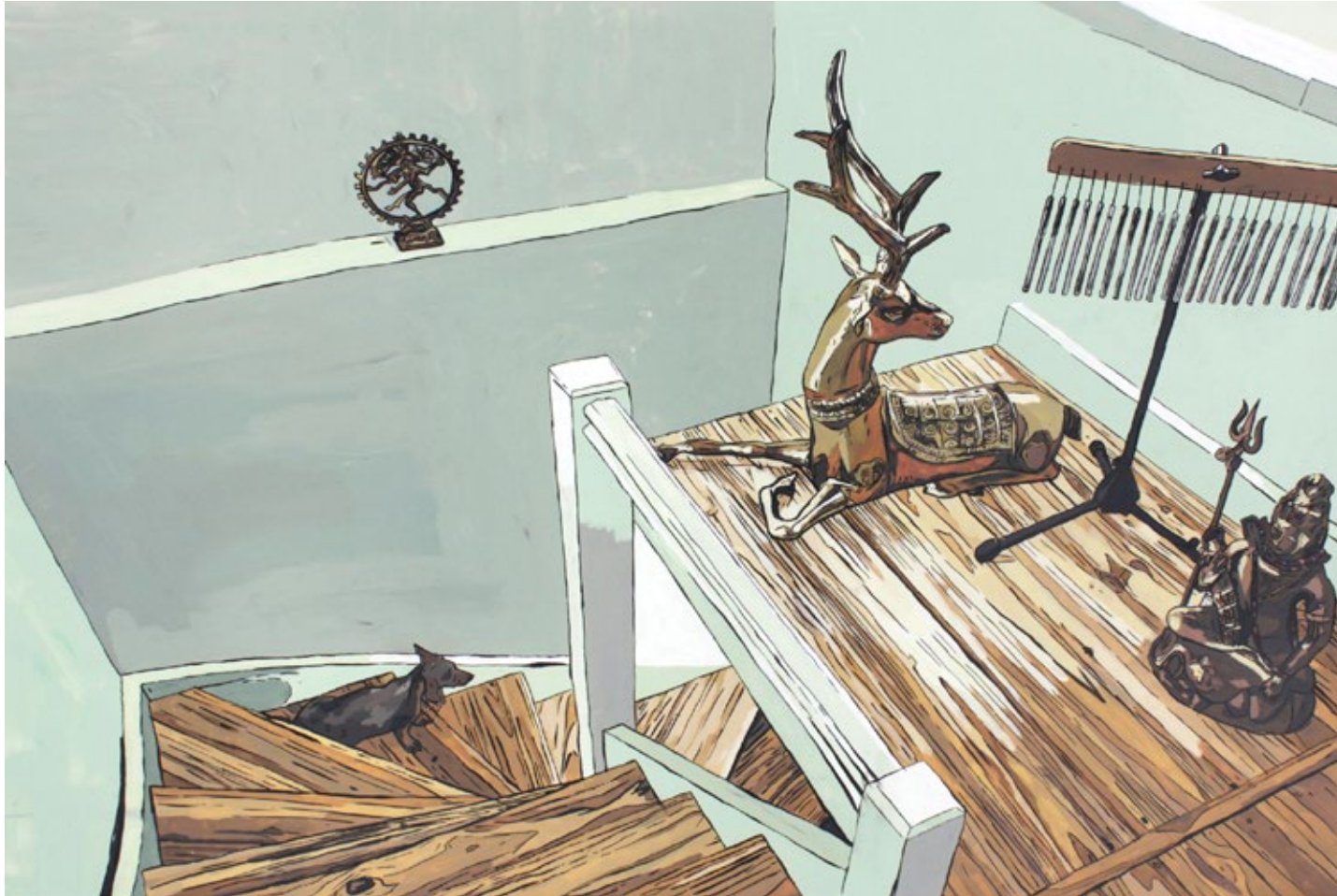
The Yogini's Watchdog

2021 Ink and gouache on film 61.3cm x 84.7cm