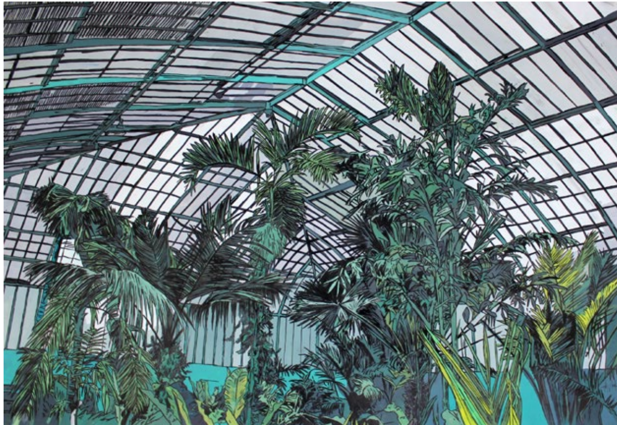
Home Away From Home