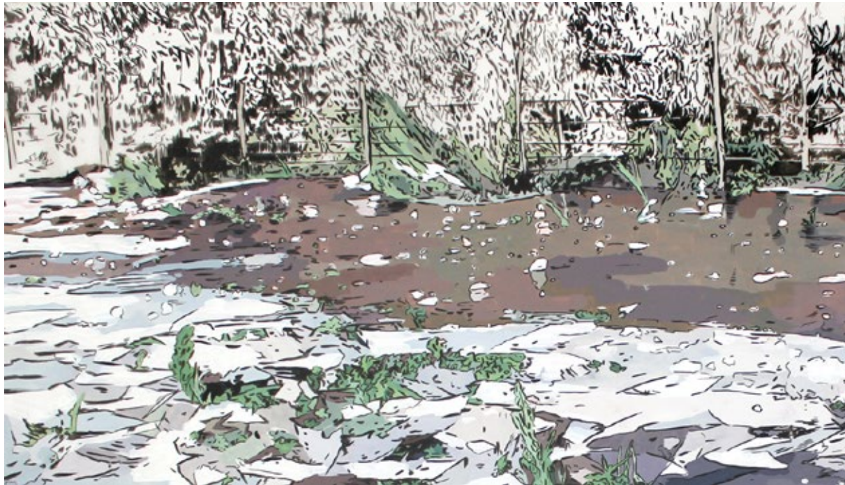
Detail of Points Of Interest