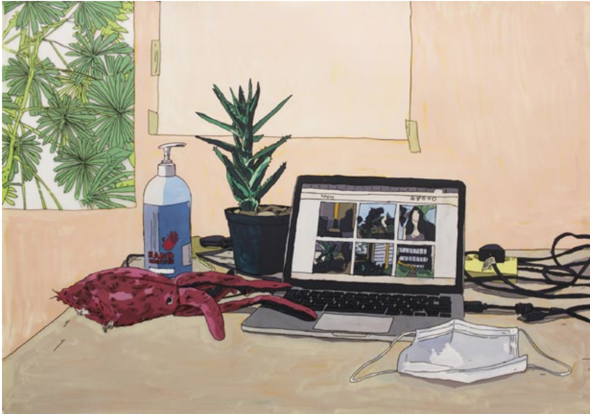
Still Life For A Pandemic

2021 Ink and gouache on drafting film 41cm x 57.5cm (framed)