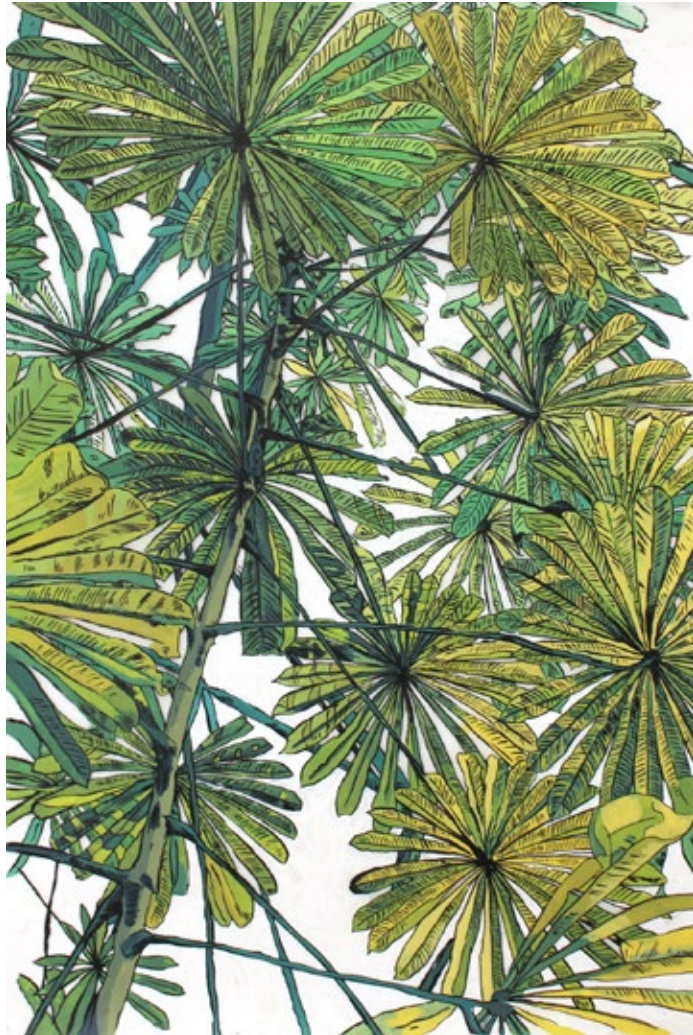
Leaves Against The Sky

2021 Ink and gouache on drafting film 59cm x 40.5cm (framed)